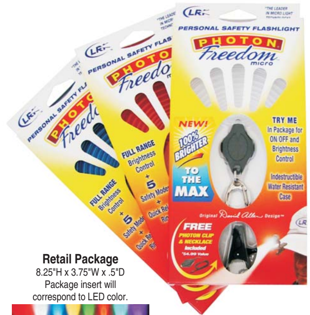
Retail Package 8.25"H x 3.75"W x .5"D Package insert will correspond to LED color.