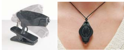
Adjustable, Multi-Purpose Photon Clip and Necklace.