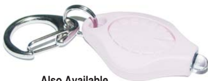
Also Available Pink Fashion Freedom Ask for Pricing