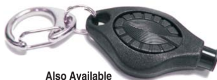
Also Available Freedom Cover The covert nose eliminates all sidelight. Ask for pricing.