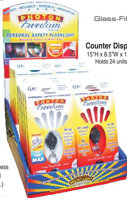
Counter Display 15"H x 8.5"W x 11"D Holds 24 units